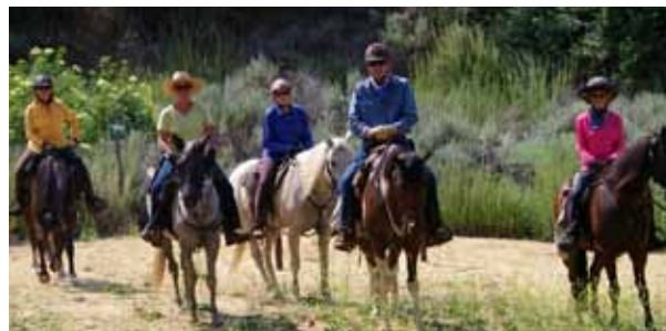
Riders on the July Breakfast Trail Ride